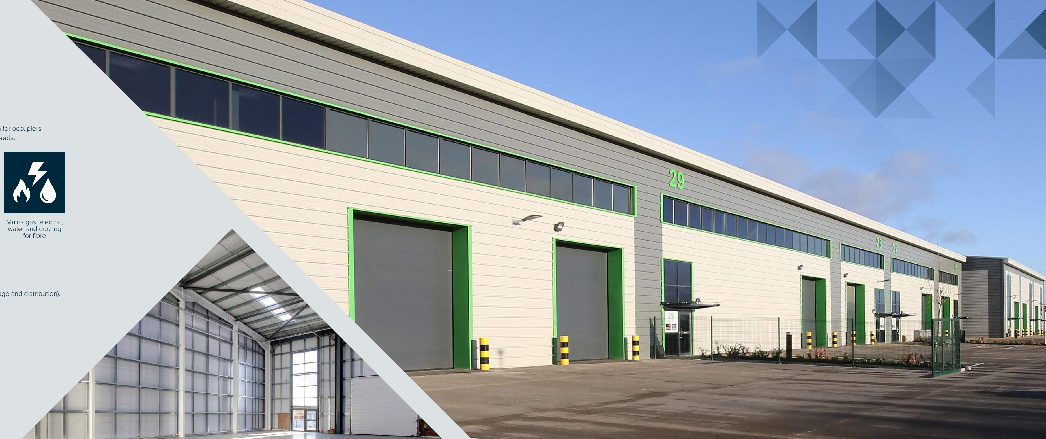
Interior image of unit 23

Available on a leasehold basis on FRI terms.